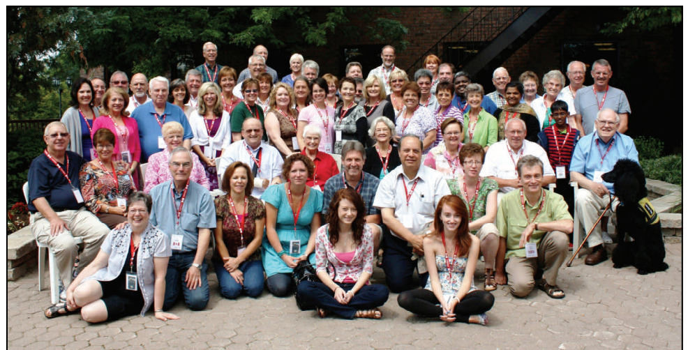
Freedom In Christ International Retreat 2010 Group Picture ~ Our theme was Renew! Refresh! Revive!

It was a good week together! Thank you to all of our Canadian staff, ministry associates and volunteers that made this event possible! It was worth all the effort!