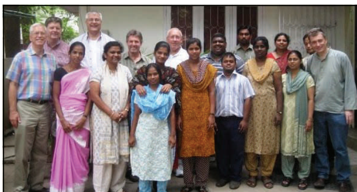
FICMI Council Members with Freedom Ministries India Staff

In Sri Lanka, over 900 attended the conference, which was translated simulta-