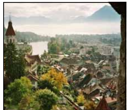
View of Thun from castle window

Homeward bound We headed home on November 23 leaving a piece of our hearts in Switzerland with these wonderful people. We are so thankful to God for his faithfulness to us and for all the friends who were praying back home.